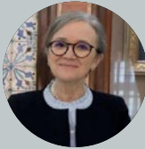
SON EXCELLENCE NAJLA BOUDEN ROMDHANE Head of Tunisian Government